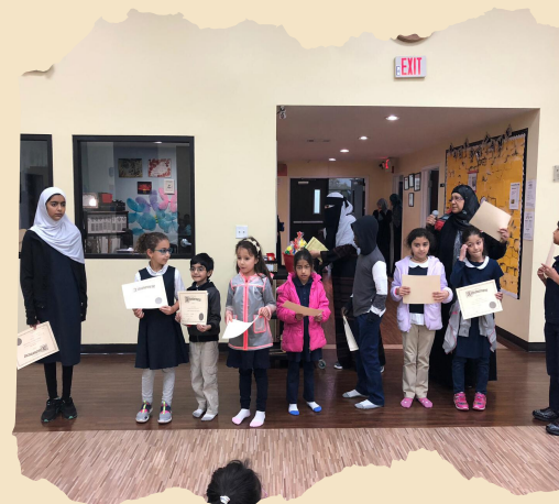
THE TOP STUDENTS FOR ISLAMIC CHARACTER TRAIT - RESPONSIBILITY