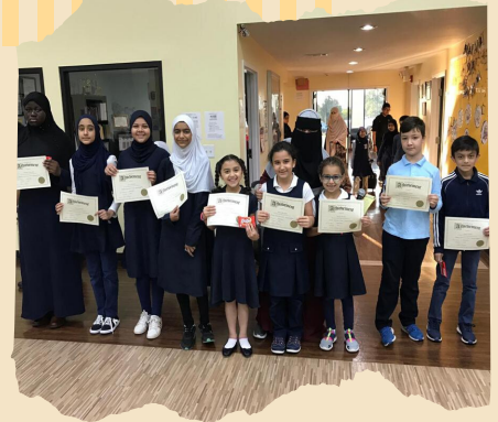
Winners for Islamic Character Trait - RESPECT