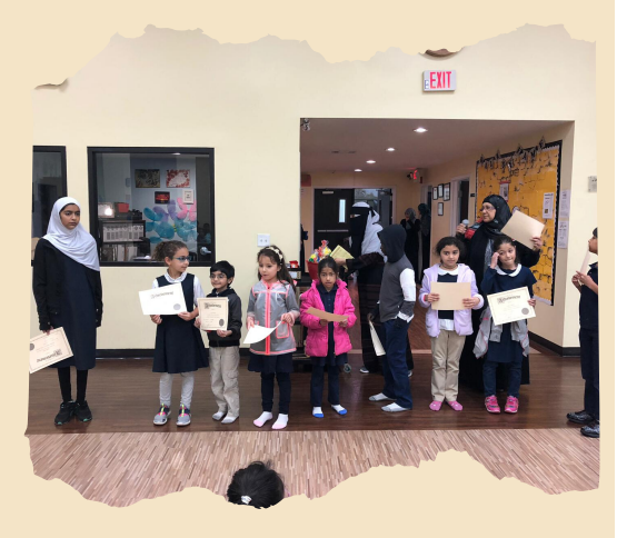
THE TOP STUDENTS FOR ISLAMIC CHARACTER TRAIT - RESPONSIBILITY