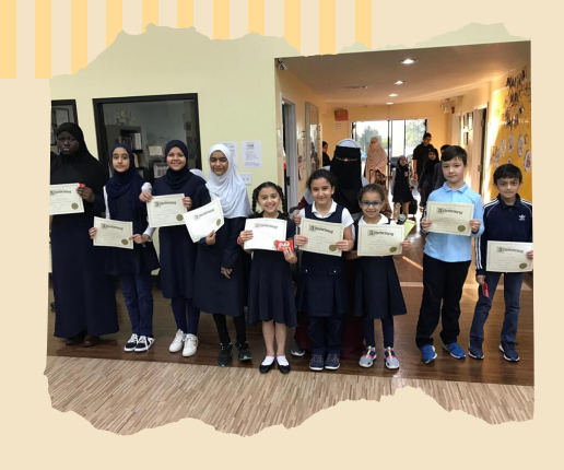
Winners for Islamic Character Trait - RESPECT