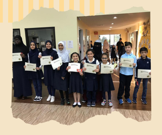
Winners for Islamic Character Trait - RESPECT